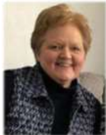
Pam Fryman 5/16/24